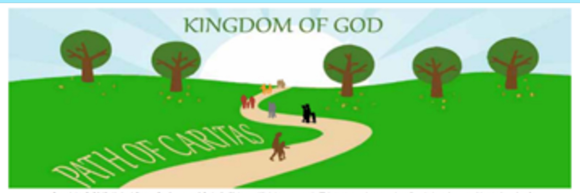
Copyright © 2013, United States Conference of Catholic Bishops. All rights reserved. This text may be reproduced in whole or in part without alteration for nonprofit educational use, provided such reprints are not sold and include this notice.